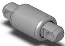
Type 2: Trunnion Pin