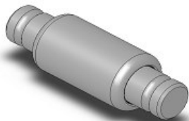
Type 1: Grooved Pin