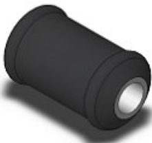
Type 2: Shouldered