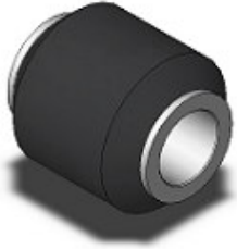
Type 1: Parallel